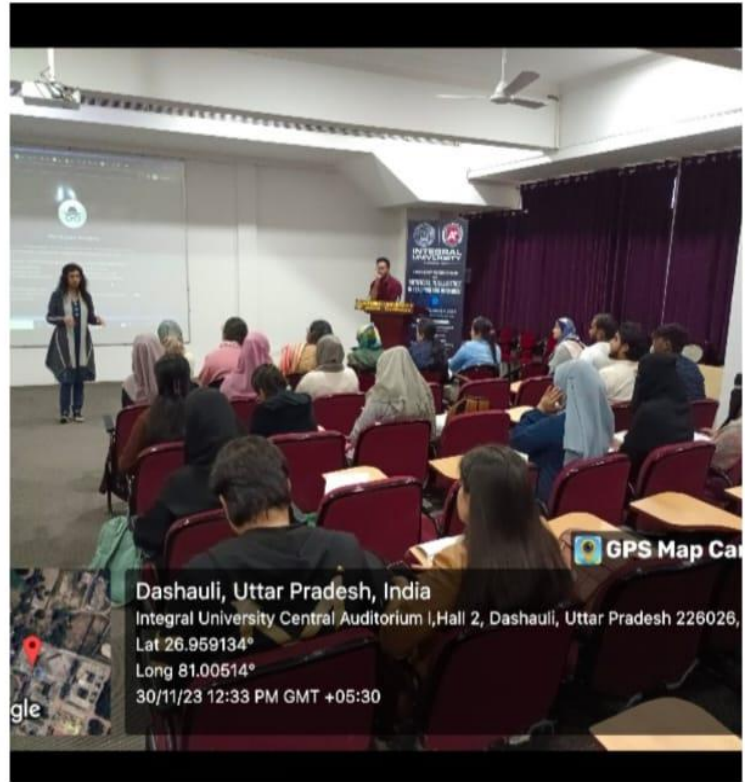
Dashauli, Uttar Pradesh, India Integral University Central Auditorium I, Hall 2, Dashauli, Uttar Pradesh 226026, Lat 26.959134° Long 81.00514° 30/11/23 12:33 PM GMT +05:30