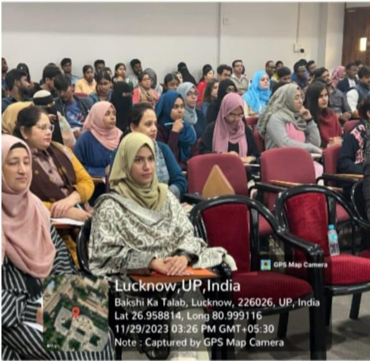
Lucknow, UP, India Bakshi Ka Talab, Lucknow, 226026, UP, India Lat 26.958814, Long 80.999116 11/29/2023 03:26 PM GMT+05:30 Note : Captured by GPS Map Camera